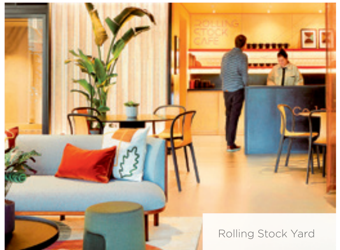
Rolling Stock Yard

This project has proved highly successful. The 7,322 sq ft second floor has been leased to Beacon Therapeutics, a Syncona-backed company, at £110.0 per sq ft, compared to £65.0 per sq ft before the refit. The lease is for five years with an occupier’s break at year three. We have also had interest from potential occupiers for the first floor at the period end. The upgraded reception area is proving popular and we are receiving requests from occupiers to use it for after-work events. Occupancy at the period end was 86.4% (31 December 2022: 66.7%).