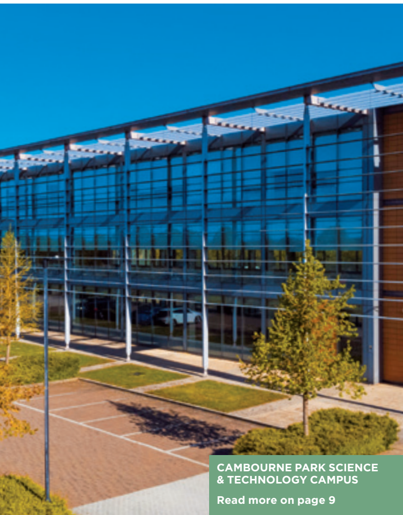
CAMBOURNE PARK SCIENCE & TECHNOLOGY CAMPUS