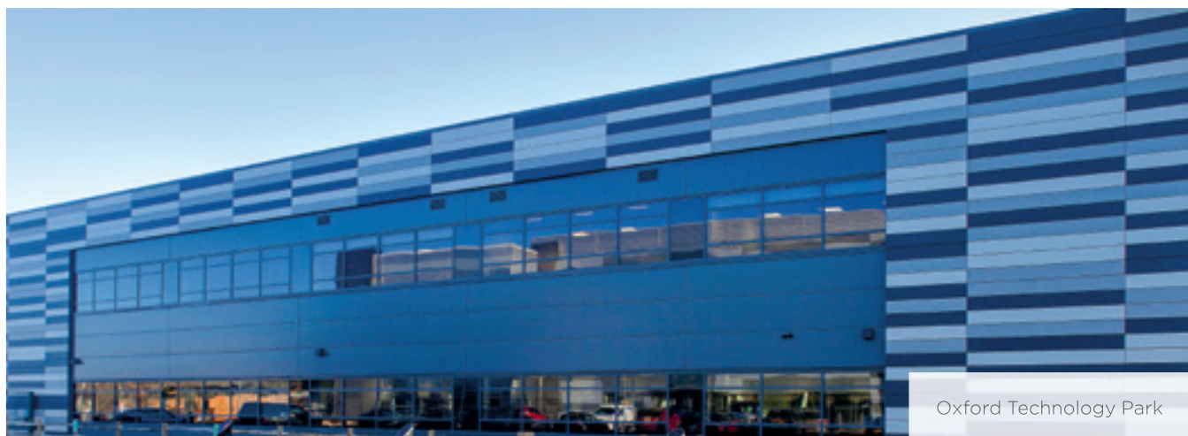
Oxford Technology Park

The buildings at OTP have strong sustainability credentials, including EPC A on Buildings 1 and 2, and all existing life science buildings and developments are tracking a BREEAM Excellent rating. The Premier Inn hotel is BREEAM Very Good. We are conducting a feasibility study on the remaining developments to look at options for retrofitting photovoltaic ("PV") panels across the park.